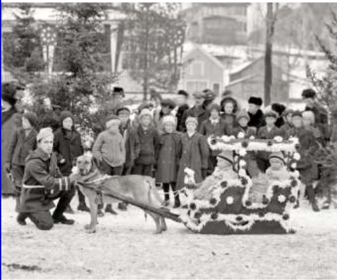
: 1909. "Midwinter carnival, children's parade with dog sled. Upper Saranac Lake, N.Y."